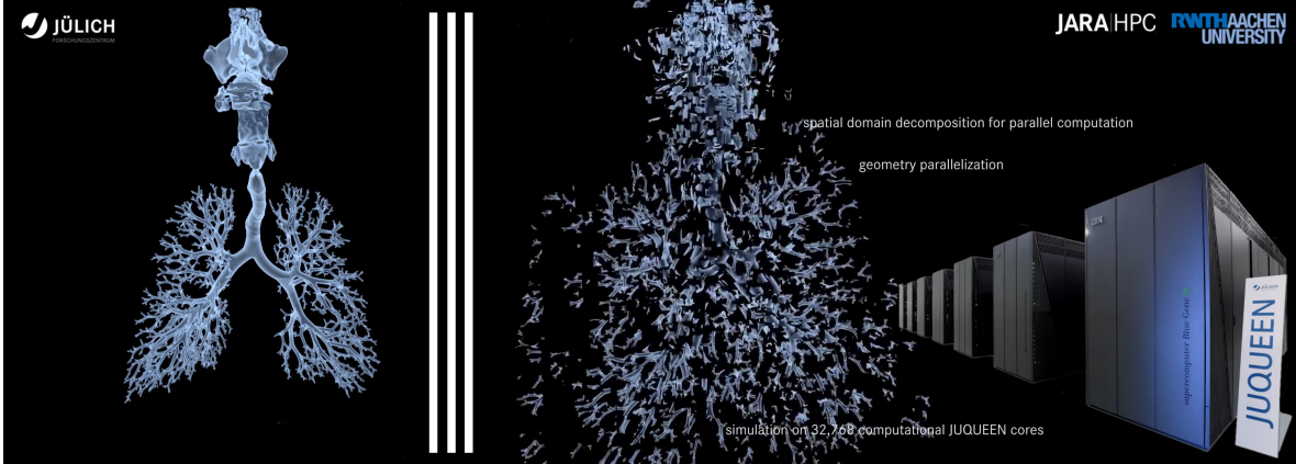
Figure 1: Comprehensible visualization of spatial domain decomposition for parallel computation on the BlueGene/Q system JUQUEEN (combined screenshots of section 3 of the movie).

by PMs in the diameter range of 2.5\text{-}10\mu\text{m} by correlating air quality measurements and lung cancer statistics in 17 cohorts in 9 European countries. Especially the economical growth in industrial and emerging countries, e.g., in the BRICS-nations Brazil, Russia, India, China, and South Africa, is responsible for the accretion of the world-wide air pollution [3]. A strong increase of fine dust pollution is however also found in developed countries like Germany, e.g., the Stuttgart region suffers from heavy traffic pollution and had to declare states of alert for 22 and 48 days in 2016 and 2017 in the months January to April 1 . This trend is also visible in the handbook “Traffic in Numbers” 2 , recently published by the German Federal Ministry of Transport and Digital Infrastructure. It is hence of high societal interest to understand the complex flow in the human respiratory tract and to quantify the deposition behavior of PM to get an estimate of the toxicity of certain substances and how the filtering mechanism of the human body works.